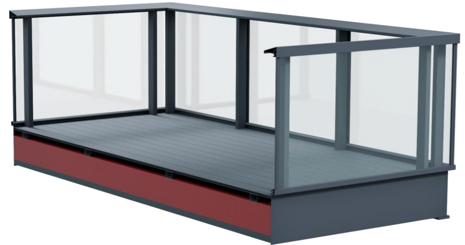
Fig. 1. Insight Glass Perspective 1

The product does not contain any REACH SVHC substances in amounts greater than 0,1 % (1000 ppm).